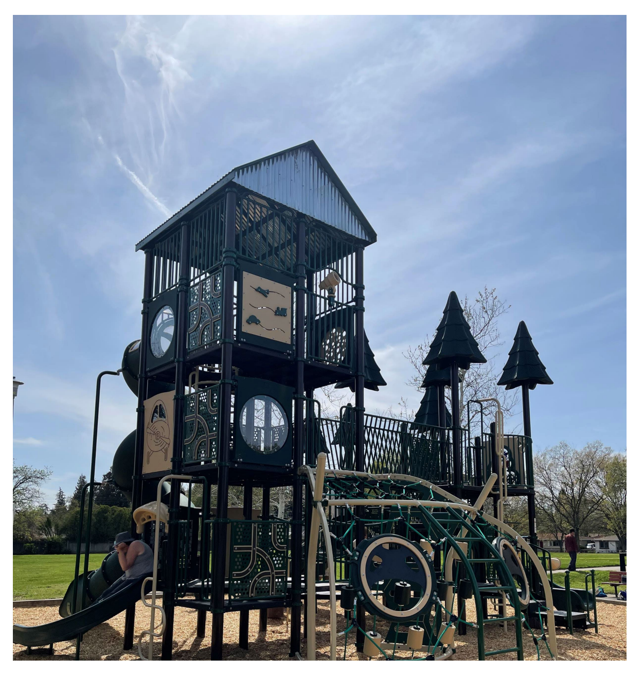
Orville Wright Park